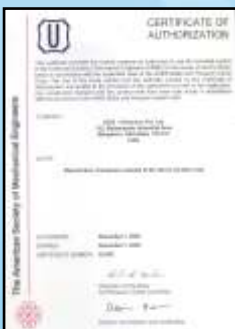
ASME 'U' STAMP